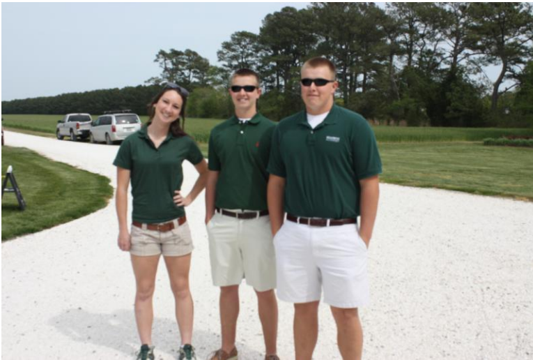
Volunteers at White Hall.