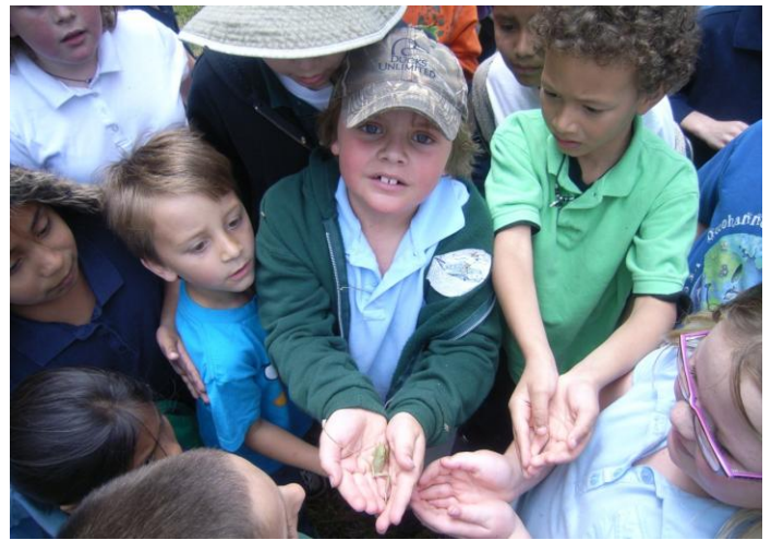
Tree frog gets attention from 2 nd graders.

Brownsville Farm is part of more than 125,000 acres permanently protected on the Eastern Shore by private landowners, conservation organizations, as well as state, federal and local governments. The Birding and Wildlife Trail at Brownsville is open all year to the public. It's a convenient, safe opportunity for families to get out in the woods and fields, see some of the marsh habitats and have a fun, relaxing time outdoors.