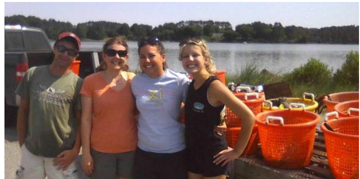
Clean the Bay Day Volunteers at Morley's Wharf, 2011.

Last year 6,500 volunteers removed 200,000 pounds of debris along more than 500 miles of shoreline during Clean the Bay Day. At Morley's Wharf eight VES Land Trust volunteers hauled 700 pounds of garbage and debris from the parking lot and surrounding marsh in about one hour! Come help us again this year the morning of June 2. Call the land trust office for more details, (757) 442-5885.