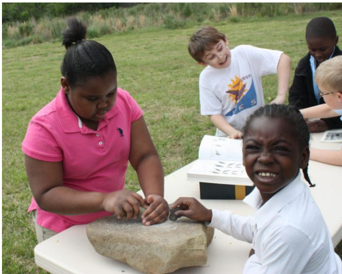
2 nd graders try their hands at grinding corn kernels with a Native American mortar and pestle.

VES Land Trust, in partnership with The Nature Conservancy's Virginia Coast Reserve and support from Citizens for a Better Eastern Shore, coordinated and sponsored a field trip for Occohannock Elementary second graders to the Brownsville Preserve in mid-April. The field trip was attended by nearly 80 children who along with their teachers and several parents spent three hours on the Brownsville Birding and Wildlife Trail. They were able to enjoy the opportunity to get out in the woods and fields, to observe different habitats, and to learn about the wildlife and plants that are so abundant on the Eastern Shore. In addition to hiking over two miles, they spent time examining turtles and tree frogs, climbed an elevated platform to enjoy a breathtaking view of the marsh, hummocks and waters that lie between the mainland and Hog Island. The children also handled Native American artifacts.